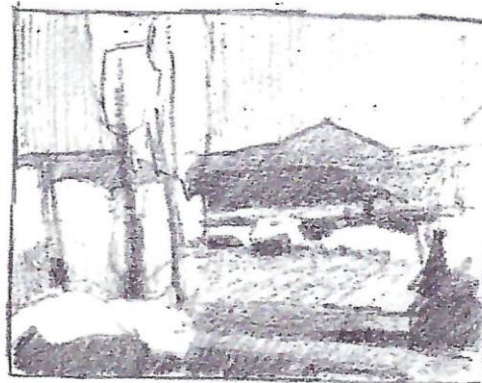
9x12 - 3:4

The key is to keep your value sketches simple. Several value sketches consisting of just 3 or 4 values and shapes can be made on 3"x5" index cards. USE A SOFT PENCIL 5B OR 6B pencil for the mid and dark tones preserving the whites. Also, "block in" your shapes vs drawing them with lines.