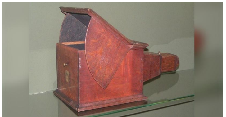
Camera Obscura device, c. 1800