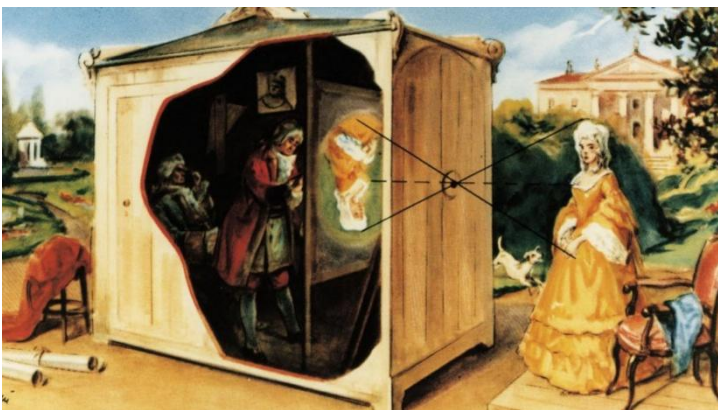
Illustration of Leonardo da Vinci's camera obscura device

The ability to permanently capture an image, however, was elusive. In 1826, a Frenchman named Niepce captured an image on paper. However, it took almost 3 hours exposure! It wasn't until 1839 that “photography” was invented in Europe. William Henry Fox Talbot, a scientist from England, is considered the inventor of the first photograph, what he called a calotype, on paper. Silver nitrate was the “magic” ingredient allowing the image to be permanent. Jacques Louis Daguerre, an associate of Niepce, also deserves credit. He was working at the same time in France, and he too captured an image on a metal plate. He later developed a commercial process to develop photographs on metal plates called Daguerreotypes. A camera started as a light tight room, then became a box like device. With the ability to capture an image permanently on film, metal plates, and paper, photography was invented. We now capture images digitally—a whole other story—but the premise is the same: photography is just another tool in an artist's toolbox.