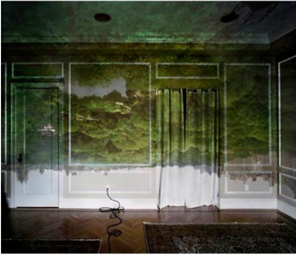
National Geographic Camera Obscura Exhibit from 2013, view of Central Park