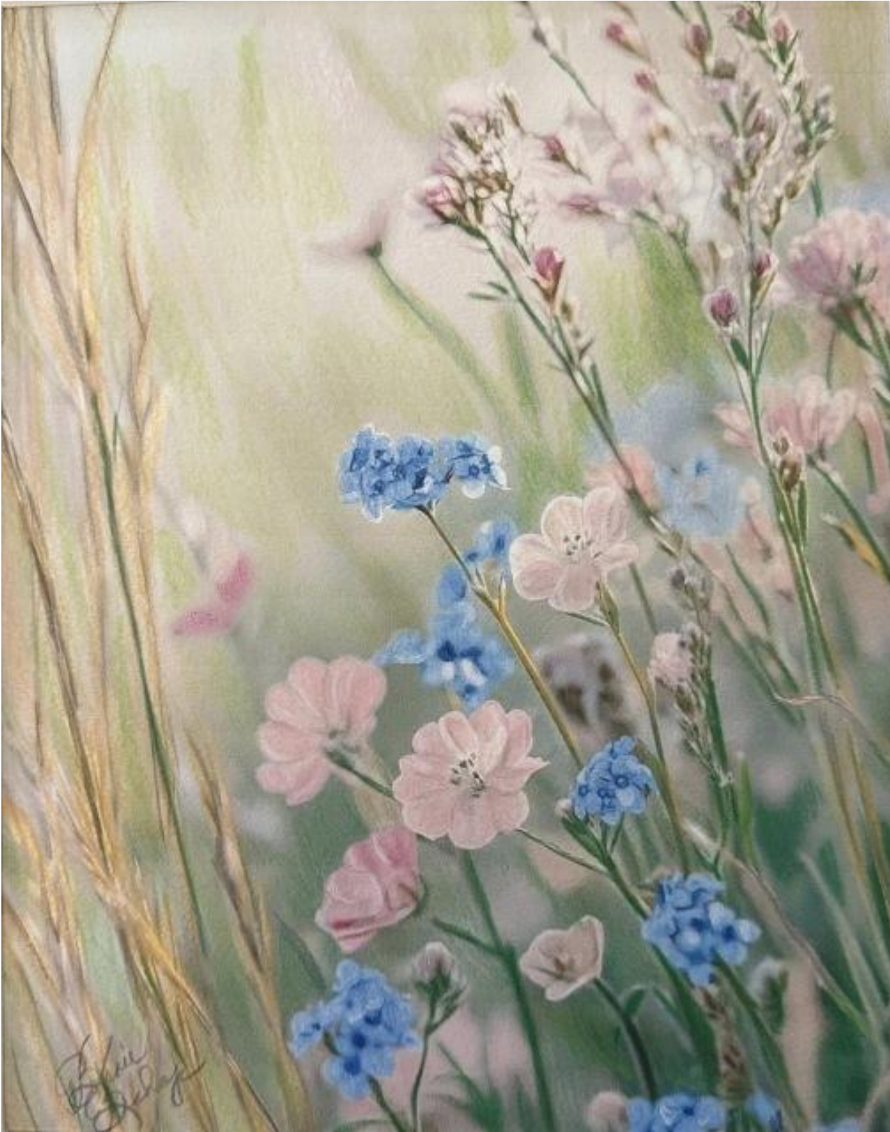
"Field of Flowers"