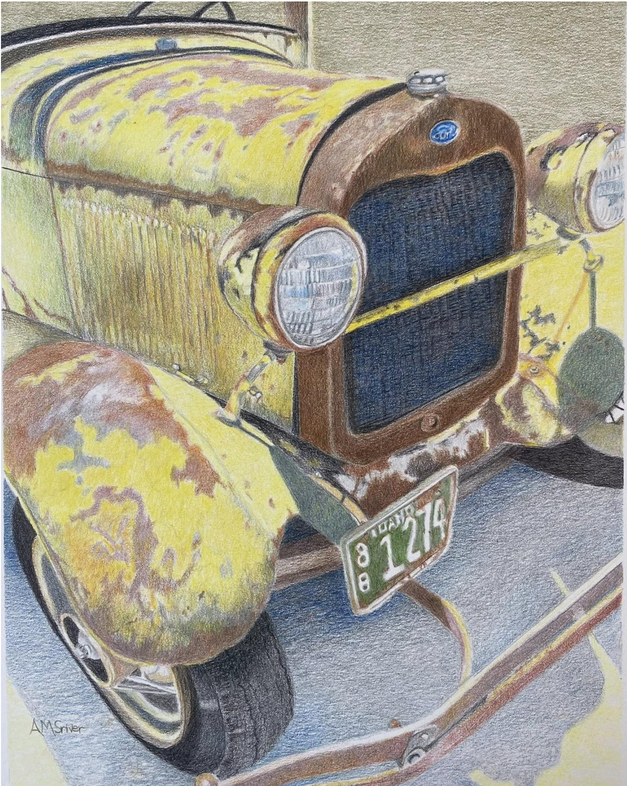
"The Rusty Ride"