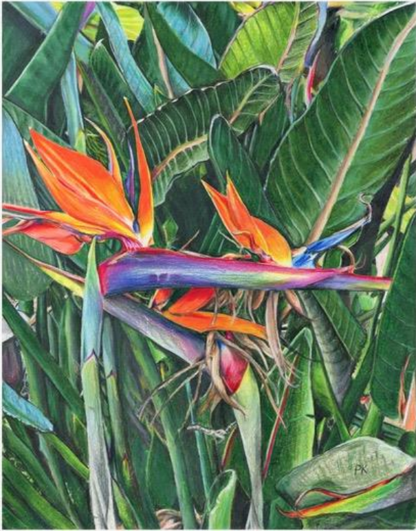
Bird of Paradise