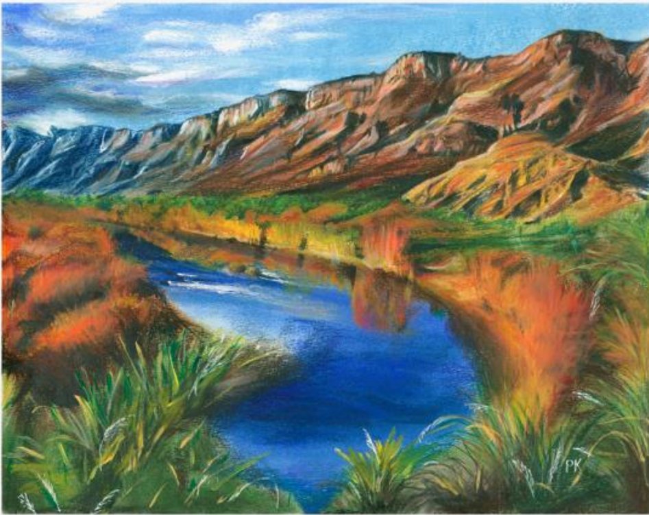
Morroccan Valley Border