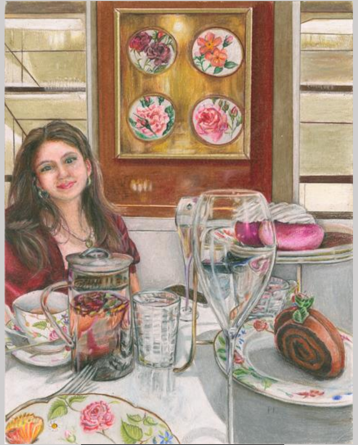
Shaynas Grand Tea in London