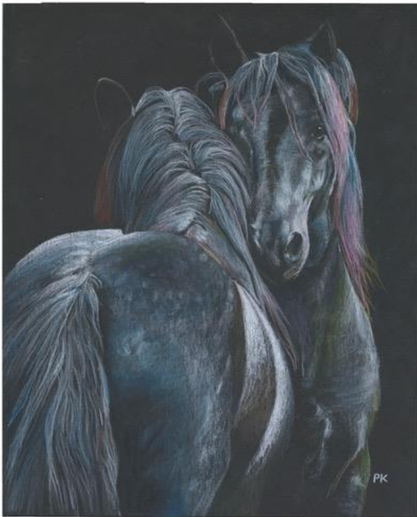
Pair of Horses