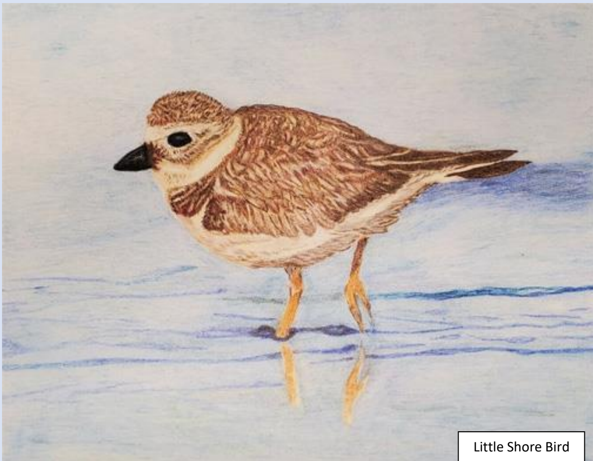
Little Shore Bird