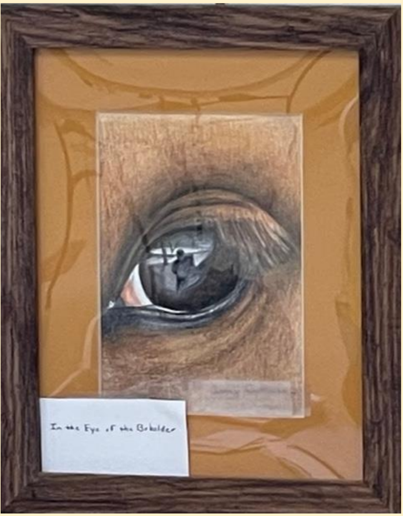
Page 11 of 16