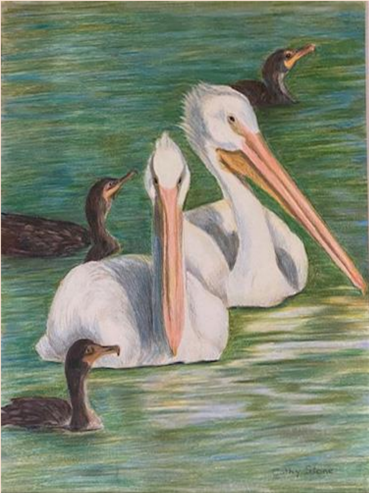
Who You Looking At